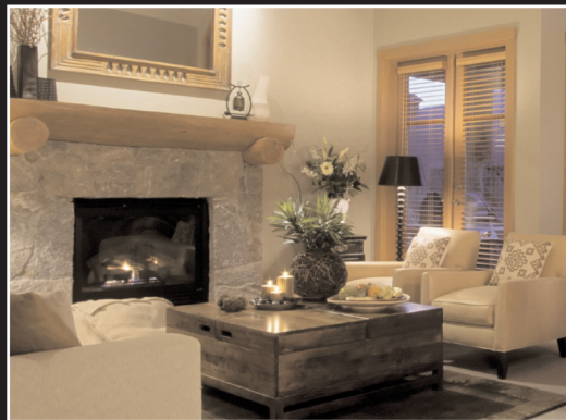
An environment with a minimal amount of dust, dirt, and odor.