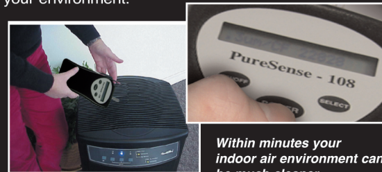
Within minutes your indoor air environment can be much cleaner

The opportunity to improve indoor air has never been easier. With our Laser Particle Counter we can accurately, within minutes measure the particulates in the environment. This Laser Particle Counter is the latest in technology and offers to be the most effective demonstration tool for accurate and reliable indoor air testing. It is used in cleanrooms, mini environments, hospital grade regulated critical areas by an indoor specialist. Within minutes our HealthWay certified representative can show you the dramatic difference a HealthWay Air Purification System can make in your environment.