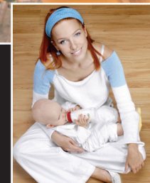
Safe for your loved ones